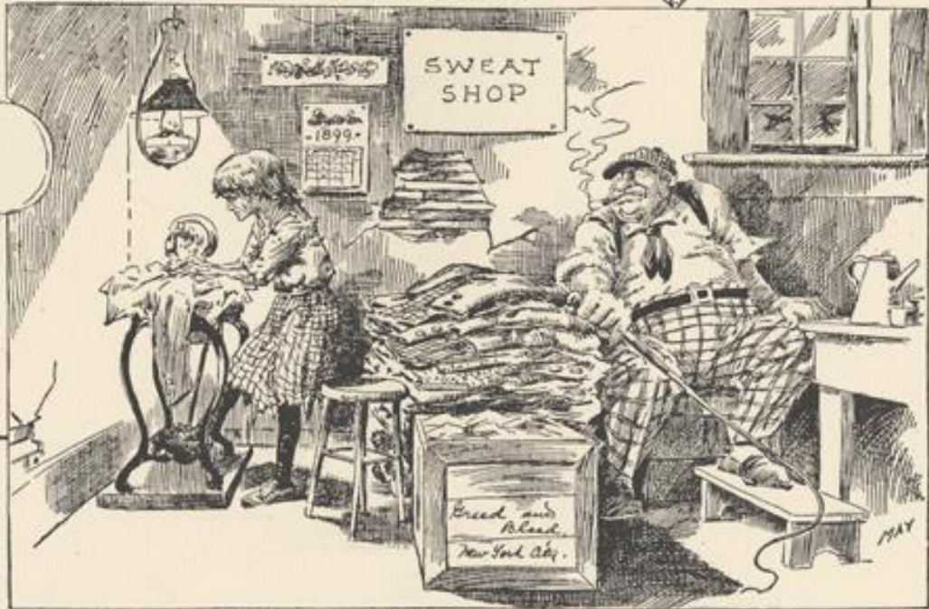
MAY IN DETROIT TIMES